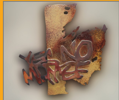
YesNoMaybe Brooch – Enamel and copper