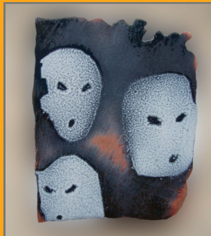
Freaky Guys Brooch – Enamel, copper